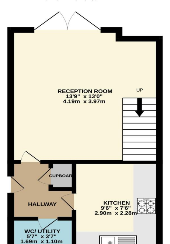
GROUND FLOOR 300 sq.ft. (27.8 sq.m.) approx.